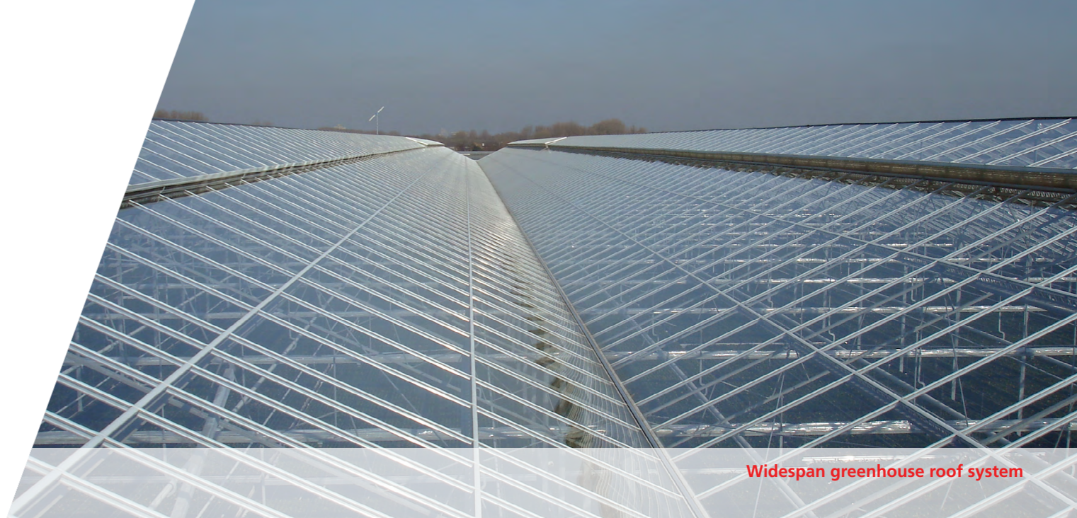
Widespan greenhouse roof system

We live up to our promises and work together to build long-term relationships. We are your reliable horticulture partner. We operate globally from the heart of Dutch