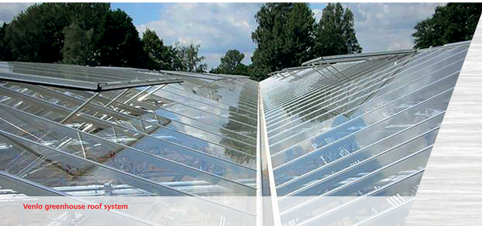
Venlo greenhouse roof system