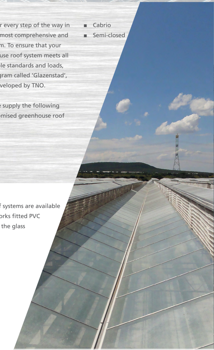
Venlo greenhouse roof system with double-sided continuous venting windows and integrated insect netting