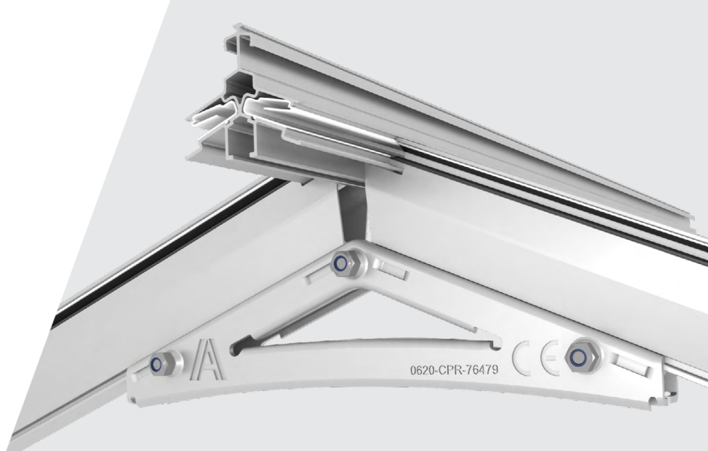
The optimised profile form, combined with the new bar-gutter connection makes the roof system extremely solid.

combined with the new bar-gutter connection and the newly designed and much more rigid ridge-bar connection mean you can be certain that the Optinova system will cope perfectly in high winds. In short, the Optinova™ is extremely strong!