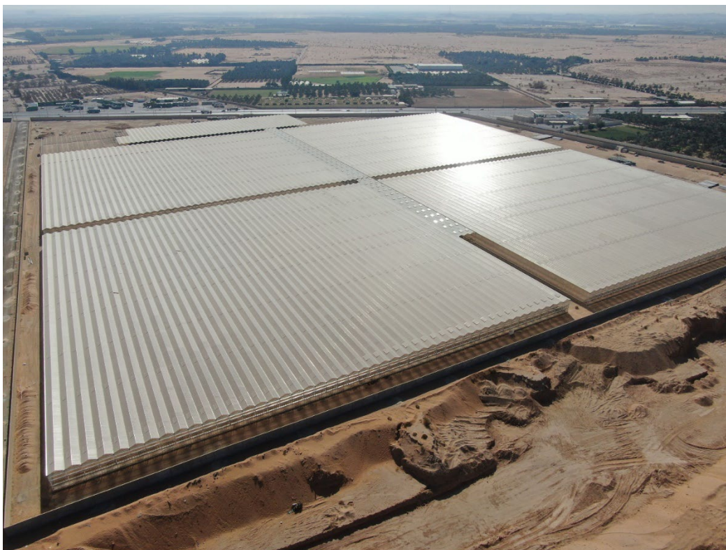
Photo: A 20 hectare semi-closed glass greenhouse project under construction for Dava in Saudi-Arabia

Dava's greenhouse complexes, including the new project, will cover over 110 hectares and are spread over 6 different locations in Saudi Arabia. At the end of this month, 30 hectares will be in operation and at the end of this year another 40 hectares will be full with vegetable plants. "The turn-key scope of the new contract allows us to implement the latest technologies with the aim of growing sustainably in this extreme desert climate," says Dylan Schalke, owner of Debets Schalke, "The order to build another 23 hectares of semi-closed greenhouse with all the necessary technology to grow in this challenging climate is something we are very proud of!"