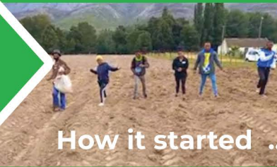
How it started ... how it's growing