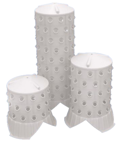
Soilless standing setup Single or multiple barrels