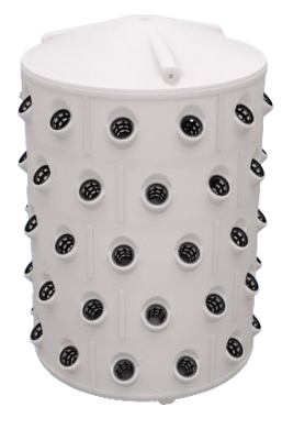
Soilless hanging setup with 2" net pots

aponix GmbH, Im Neuenheimer Feld 583 69120 Heidelberg, Germany.