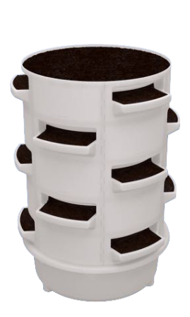
Substrate-based setup Raised bed alternative