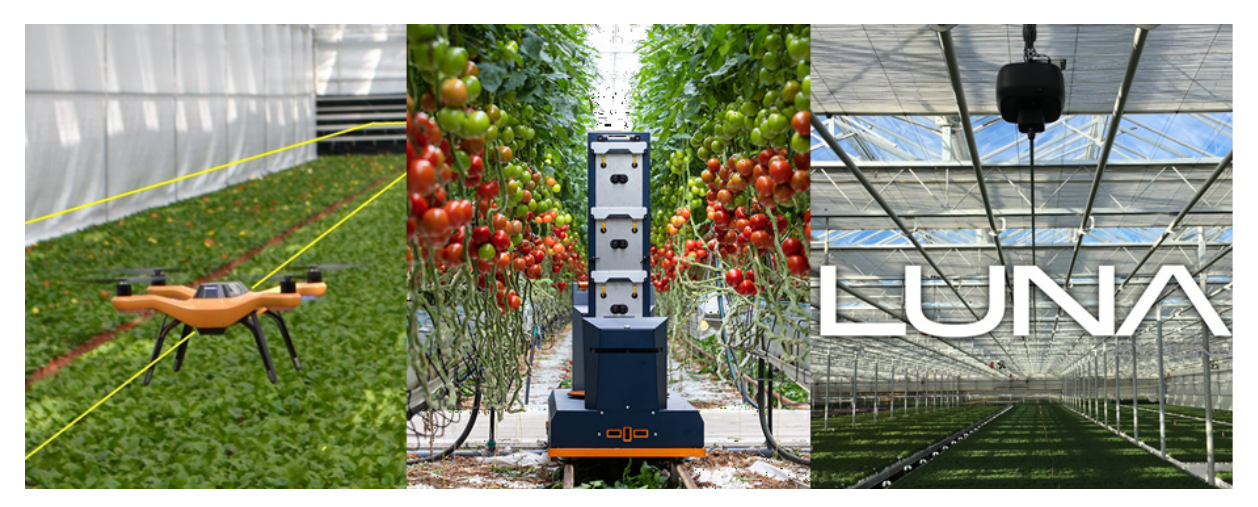
Figure 2 Corvus' autonomous drone, Hortikey's Plantalyzer and IUNU's LUNA

<u>Rail system</u> are the third system we see as a potential candidate to gather crop related data. The cameras and sensors are equipped on a device which is guided through the greenhouse on a system of rails. An example is LUNA from the company IUNU, who attaches cameras to a rail system in the greenhouse.