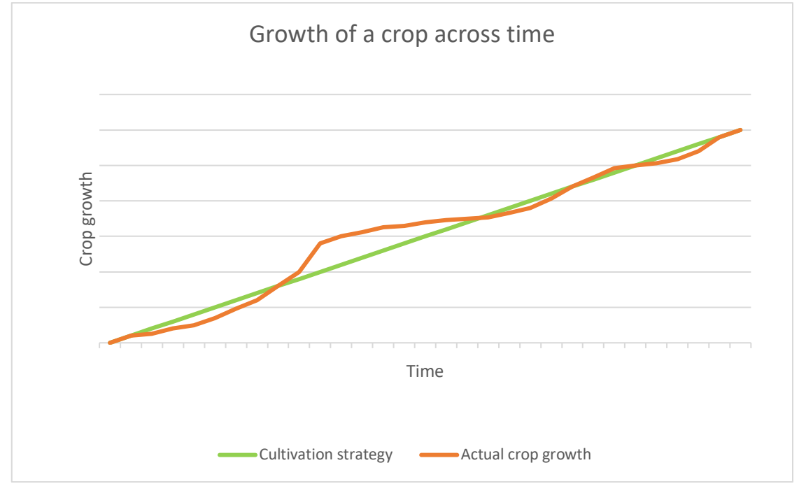
Figure 4 Example of crop growth across time

In figure 4, an example is given of the crop growth across time. The green line is the growth of the crop according to the predetermined cultivation strategy. The orange line is the actual growth, where the greenhouse management system is continuously trying to stay as close as possible to the green line. At the start of the growing season, the vision system identifies that the crop is a bit behind schedule and sends the feedback to the management system. The management system considers the weather of the coming weeks and decides to boost the crop growth by changing one of the many actuators. The weather, as unpredictable as it is, changed after the decision was made and the crop grew faster than was planned. The management system identifies this and slows the growth of the crop down again while at the same time saving his 'mistake'. The crop continues to grow, and you see a stabilizing effect where the crop growth is deviates less and less from the cultivation strategy.